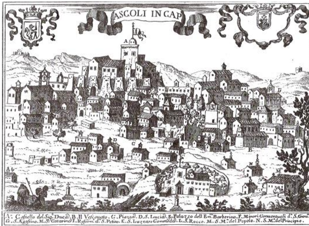
Figure 2: Ascoli Satiano in 1703